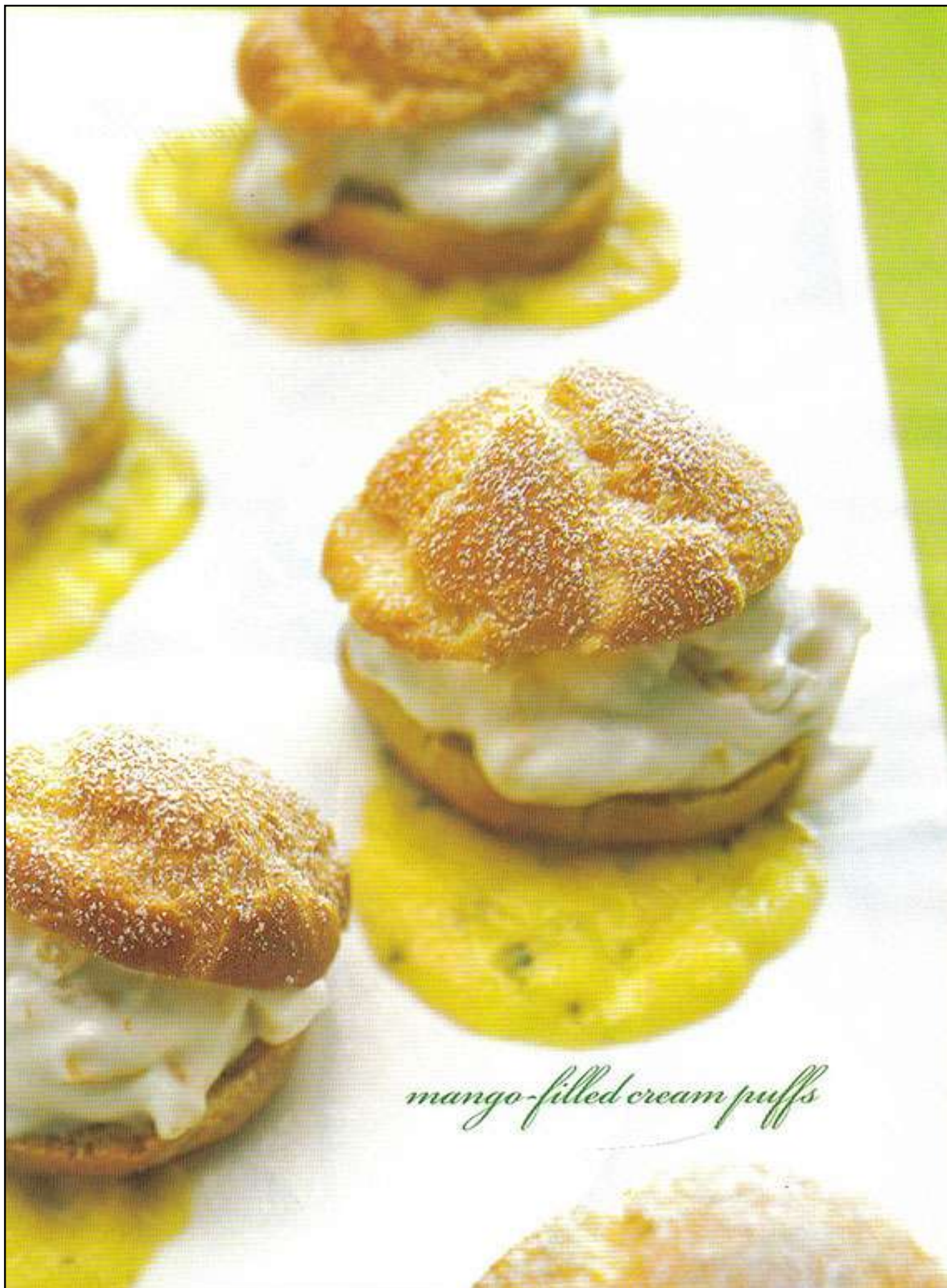
mango-filled cream puffs